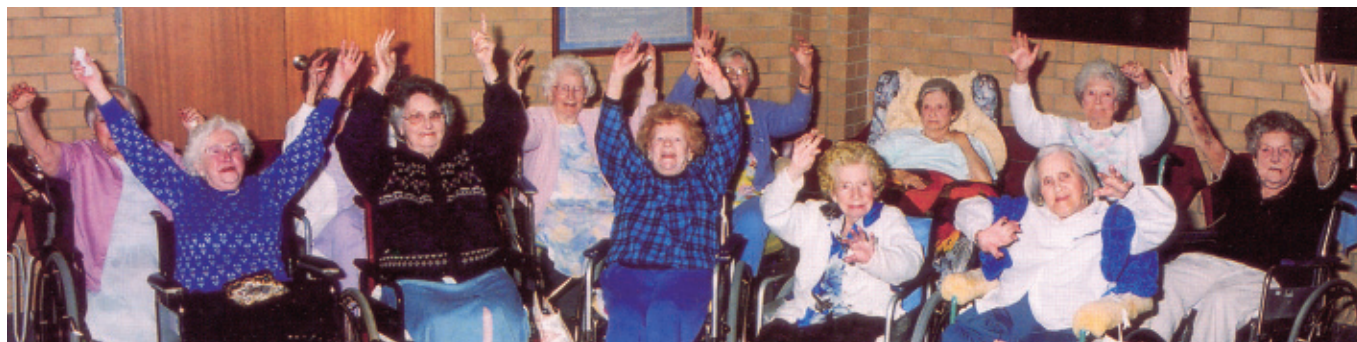
The Calendar Girls