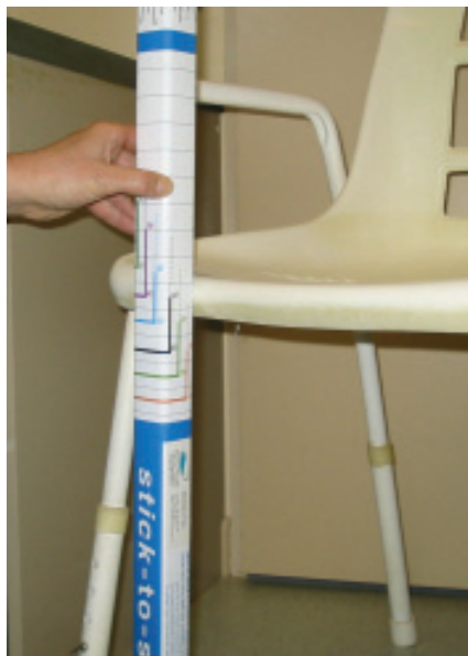
Adjust furniture (approximately 100% – 110% of lower leg length).

- Carers should stand behind the person and