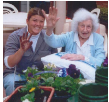
Resident and volunteer enjoy the gardening project