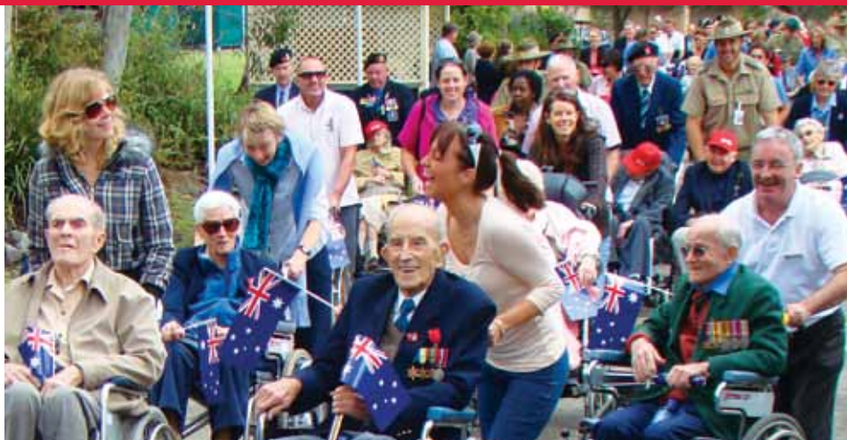
RSL ANZAC march

Monthly newsletter from Aged Care Standards and Accreditation Agency