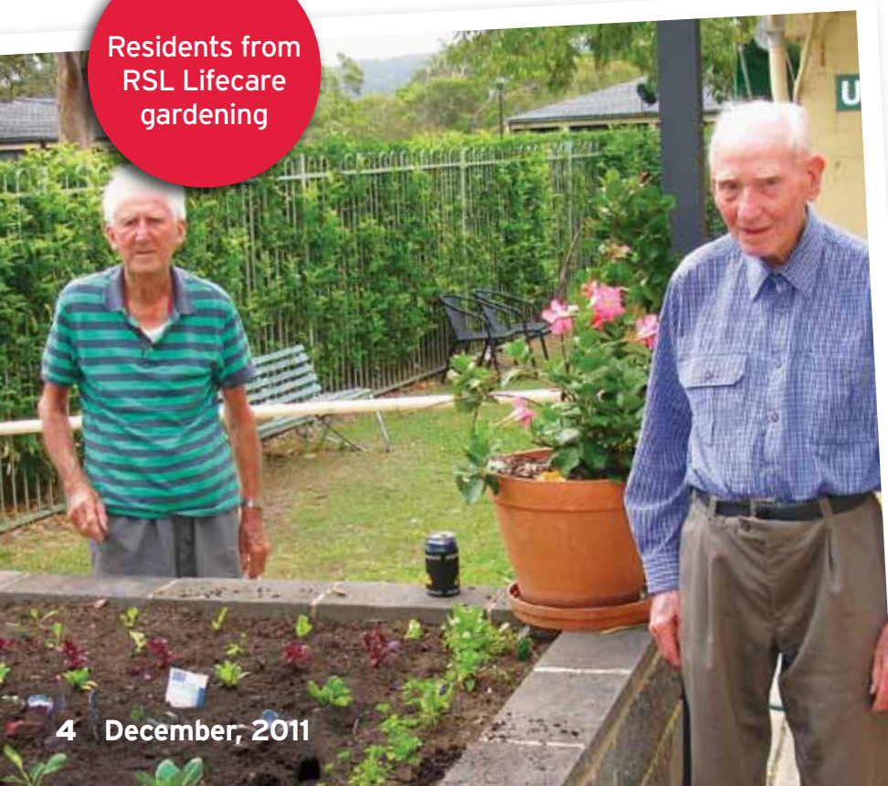
Residents from RSL Lifecare gardening