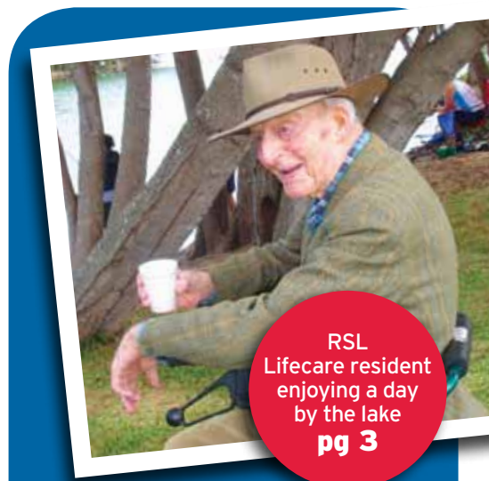
RSL Lifecare resident enjoying a day by the lake pg 3