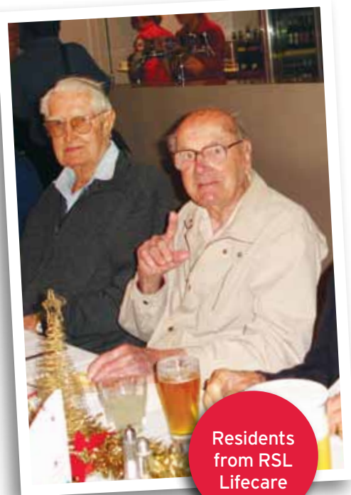
Residents from RSL Lifecare

While the effects are not long-lasting, there is clearly some benefit for the duration of the sessions, with participants enjoying a meaningful activity. ■